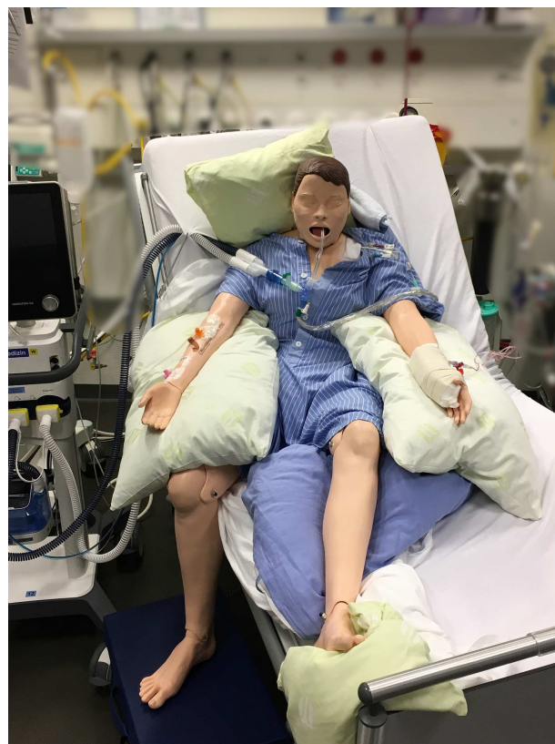
Figure 2. Passive mobilization into a side-position on the edge of the bed (side-edge). To achieve this position, patients are turned to the side and their backs supported with a large pillow (not visible). Then the bedhead is slowly raised, one leg placed on the floor and the position supported with pillows (as shown). The center of gravity remains in the bed, but patients are closely monitored by a nurse or therapist to ensure safety (see also Suppl. Fig. 2).

This 69-year-old male was admitted to the ICU after a dry cough for 2 weeks, oxygenation was poor and computer tomographic imaging showed typical COVID-19 pneumonia. Initially the patient received lung-protective ventilation and targeted sedation, but was otherwise stable. Treatment interventions included passive range of motion and positioning including passive mobilization into a side-edge position (Fig. 2). Over the next days, the patient deteriorated with