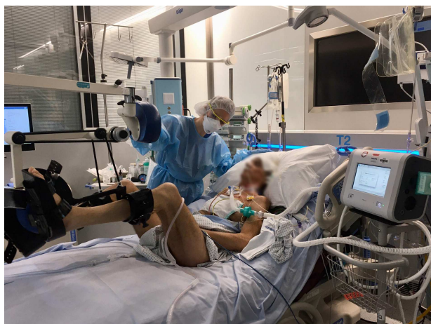
Figure 3. A patient under assisted ventilation starts to move again by cycling actively in bed at a moderate workload (MOTomed letto2; Reck-Technik GmbH, Betzenweiler, Germany). Reproduced with written informed patient consent.

Currently, the patient tolerates spontaneous breathing trials, shows signs of being alert during therapy, but cannot communicate. He is hemodynamically stable, even in an SOEB position, but remains functionally dependent (CPAx 6/50).