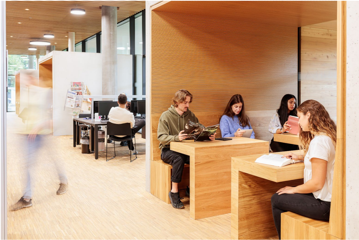
Campus Library